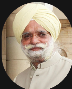
Mr. K.T. S. Tulsi