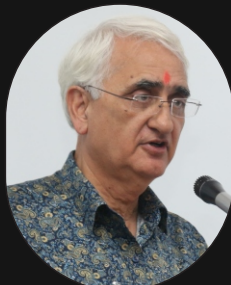
Mr. Salman Khurshid