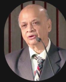
Hon'ble Mr. Justice Arijit Pasayat Former Judge Supreme Court of India