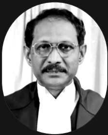
Hon'ble Mr. Justice C.T. Ravikumar Judge Supreme Court of India