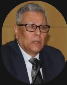
Hon'ble Dr. Justice Mukundakam Sarma Former Judge Supreme Court of India