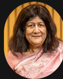
Hon'ble Ms. Justice Indira Banerjee Former Judge Supreme Court of India