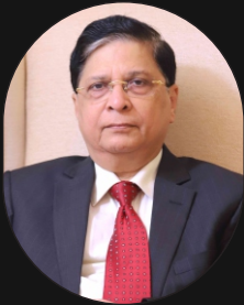
Hon'ble Mr. Justice Dipak Misra Former Chief Justice of India