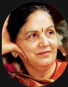
Hon'ble Ms. Justice Gyan Sudha Misra Former Judge Supreme Court of India