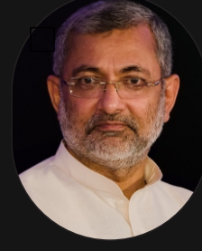
Hon'ble Mr. Justice Kurian Joseph Former Judge Supreme Court of India