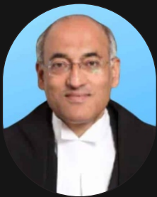
Hon'ble Mr. Justice Najmi Waziri Former Judge High Court of Delhi