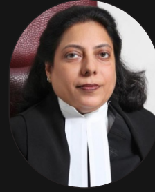
Hon'ble Ms. Justice Mukta Gupta Former Judge High Court of Delhi