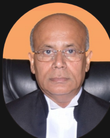
Hon'ble Mr. Justice Navin Sinha Former Judge Supreme Court of India