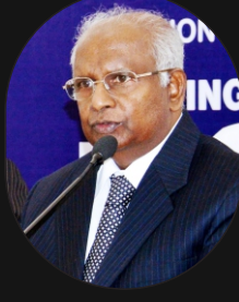
Hon'ble Mr. Justice K.G. Bala Krishnan 37th Chief Justice of India and Former Chairperson, NHRC