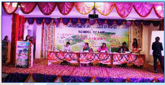
National Seminar in Progress