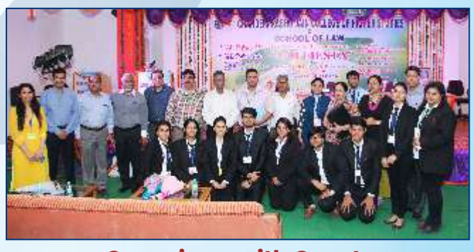
Organizers with Guests