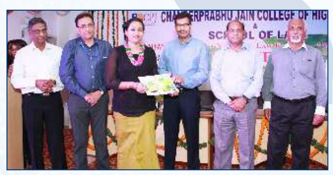
Felicitation of Participants