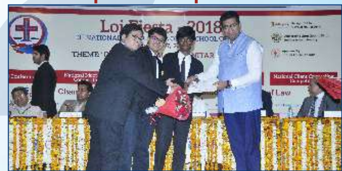
Moot Court Winners being Awarded in Felicitation