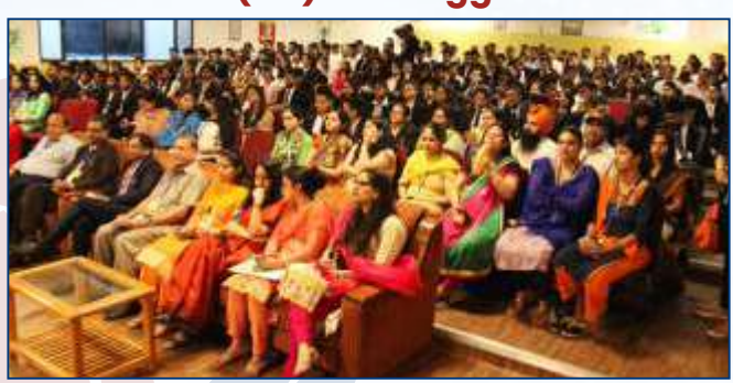
Glimpse of Audience @ LOI FIESTA 2017