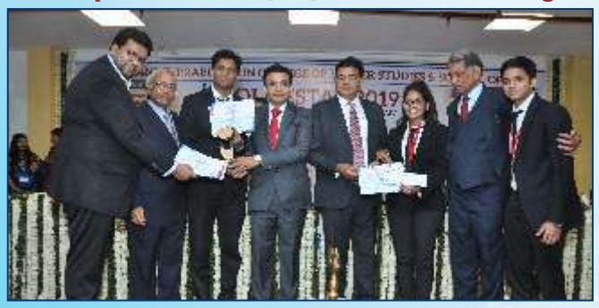
Moot Court Winners being Awarded by Guests in the Valedictory Ceremony